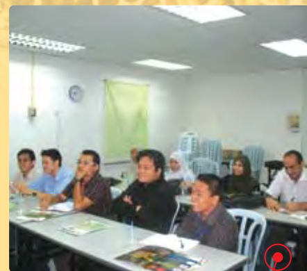
6 UKM Men Students.