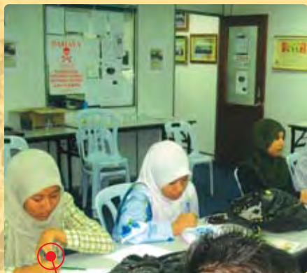
3 UKM Ladies Students.