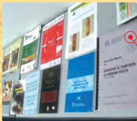
PCAM Library materials on display.